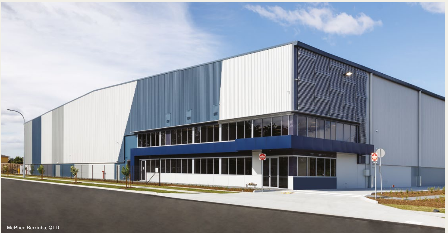
McPhee Berrinba, QLD